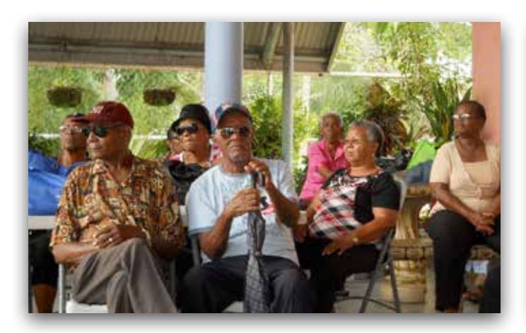
The audience at the Mon Repos Senior Citizens Outreach