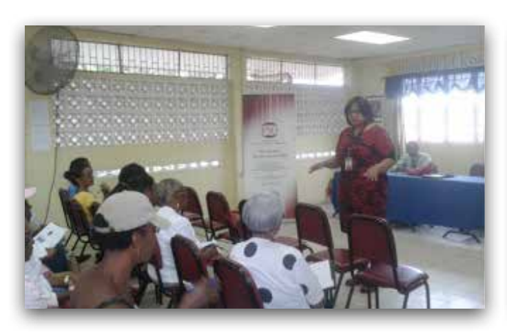
The Financial Services Ombudsman speaking with the Coterie of Social Workers members in Barataria