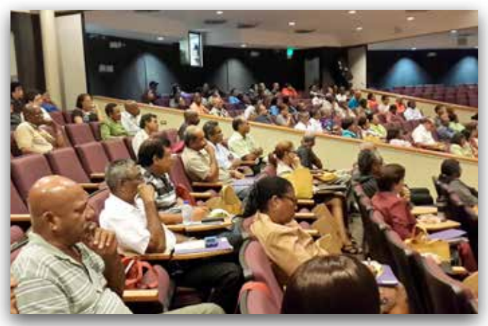
UWI Pre-Retirement Seminar where the OFSO presented on preparing your finances for retirement