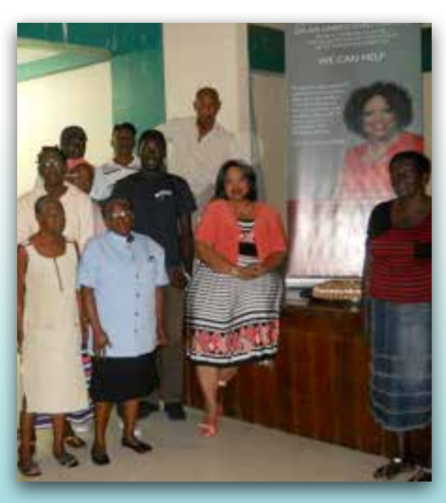
OFSO goes to Charlotteville, Tobago.

As such, the sessions touched on subjects related to the importance of budgeting, securing pensions and the dangers of retirees or elderly persons trusting persons purporting to have their best interest at heart. These include family and/or friends having control over their funds as well as when they receive emails or texts from unknown persons with possible fraudulent scams. Included in the discussion at the sessions were planning for retirement and the role of the Financial Services Ombudsman highlighting the scope within which the Agency is allowed to operate as it relates to Banking, Insurance and Non-Bank Financial Institutions.